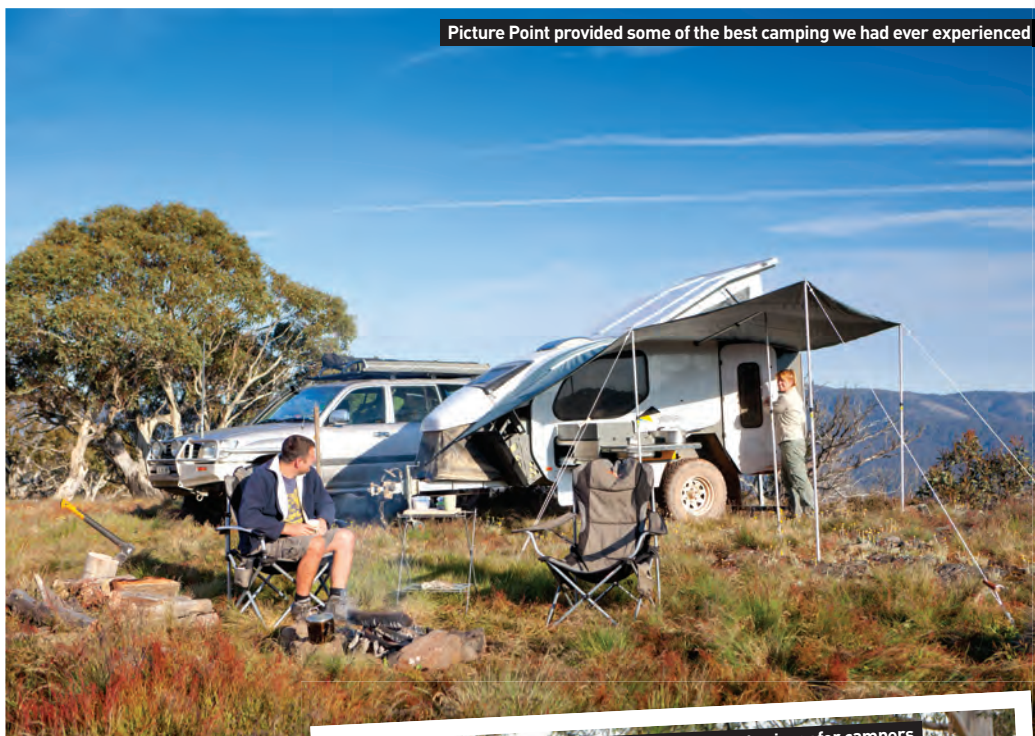
Picture Point provided some of the best camping we had ever experienced