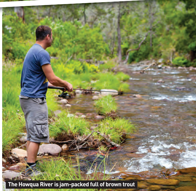
The Howqua River is jam-packed full of brown trout