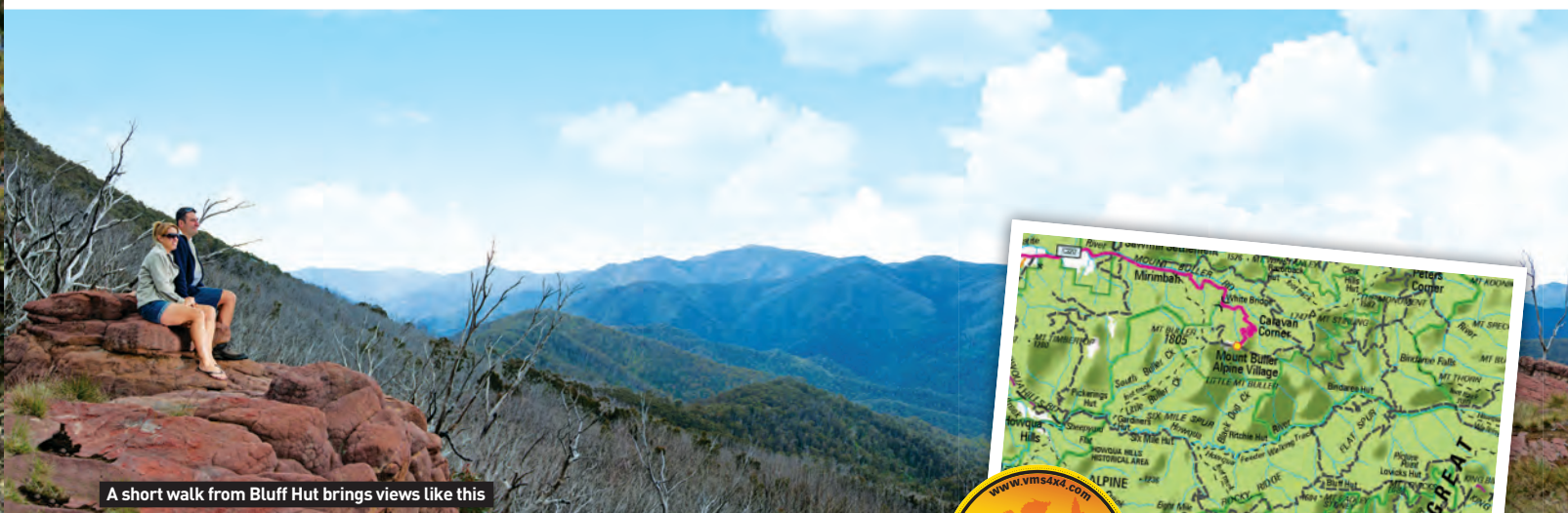
A short walk from Bluff Hut brings views like this