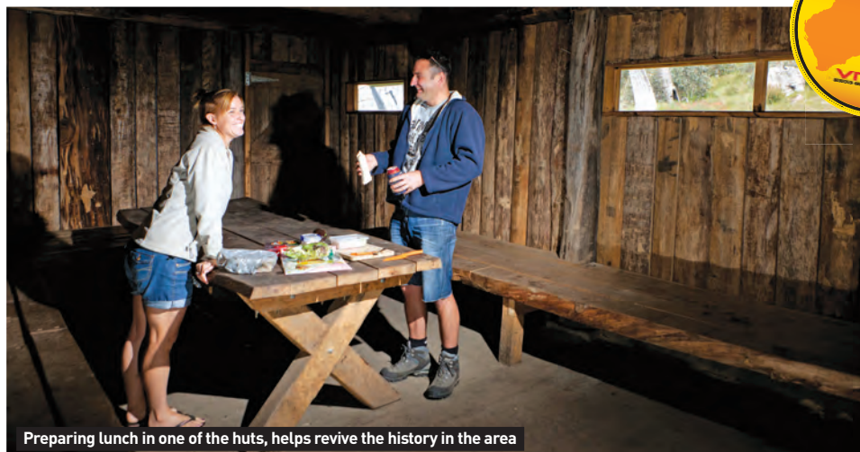
Preparing lunch in one of the huts, helps revive the history in the area