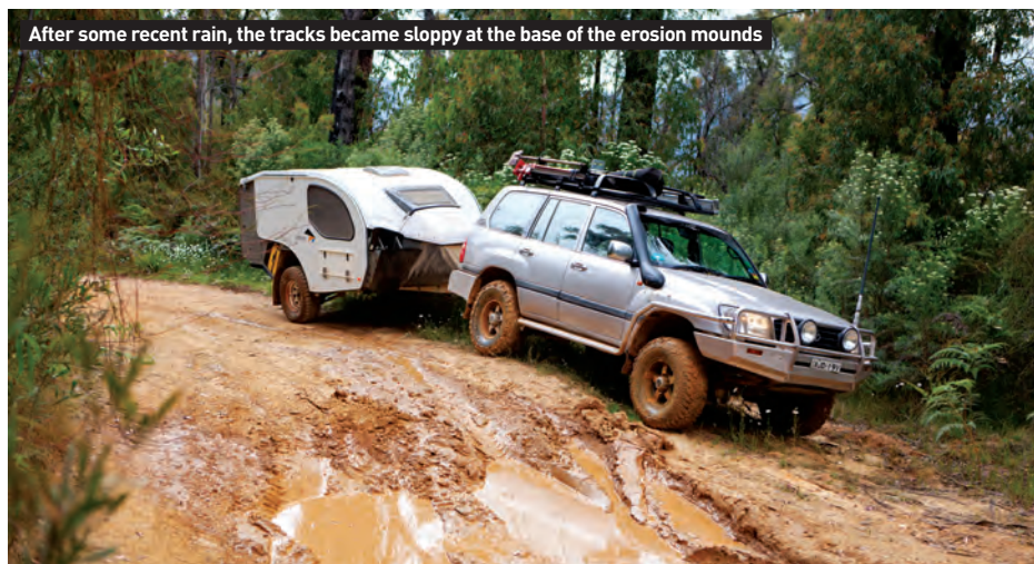
After some recent rain, the tracks became sloppy at the base of the erosion mounds

wheels all facing rock ledges at the same time, traction is the key. It's a lot of fun, and you're assured 2WDers won't be up here.